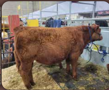
Care's Mr PLD Lady's Man 8L