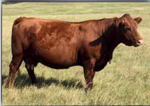
SSS YFS MISS NORRIS 60T