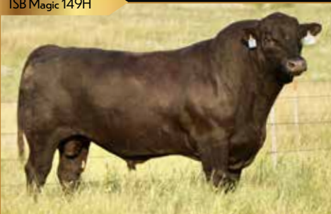
TSB Magic 149H