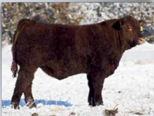
KEYS ROCKSTAR 83K