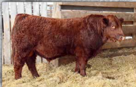
YFS SSS ATOMIC 4L