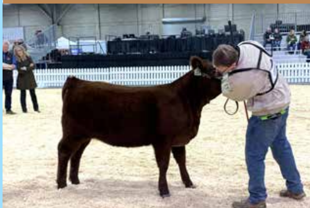
SW ALEXIS 43L