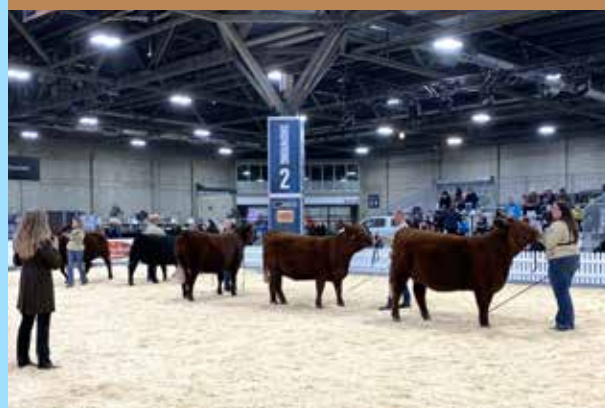
FEMALE GRAND CHAMPION LINE - UP