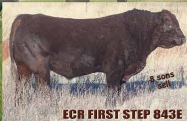
ECR FIRST STEP 843E