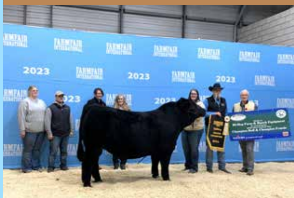
GRAND CHAMPION BULL - WWCS KAYO 581K