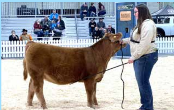
OPTIMIZER CHAMPION FEMALE - TSC 377L