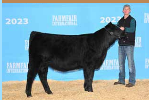
YFD SSS MISS LUXURY 83L