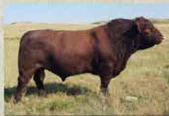
MAC ATOMIC FORCE 36A