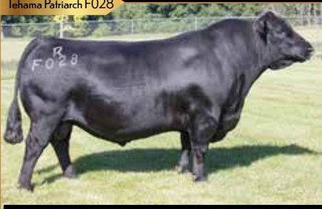
Tehama Patriarch F028