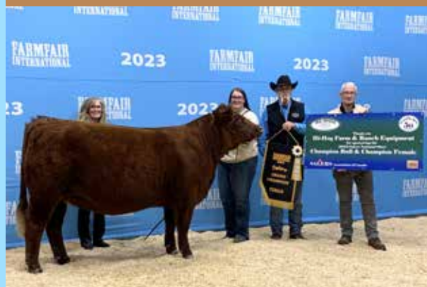
GRAND CHAMPION FEMALE - YFS 47K