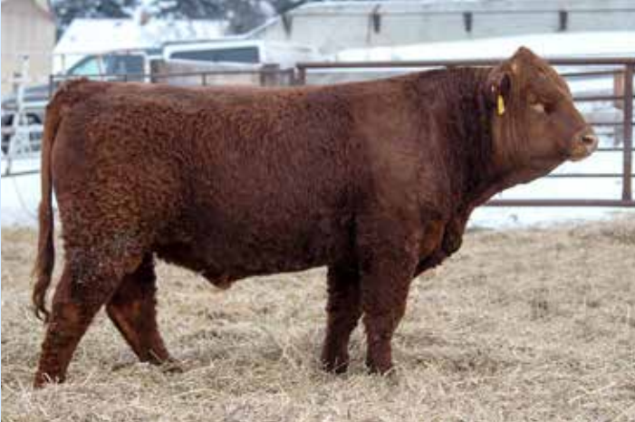
SW44K by SW GRANITE 63G