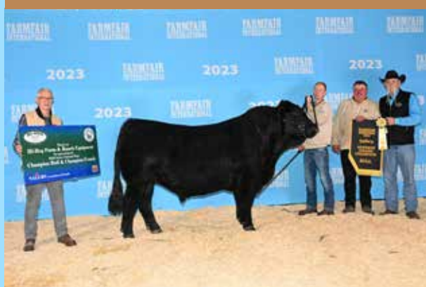
RESERVE CHAMPION BULL - TCS DR J 1J