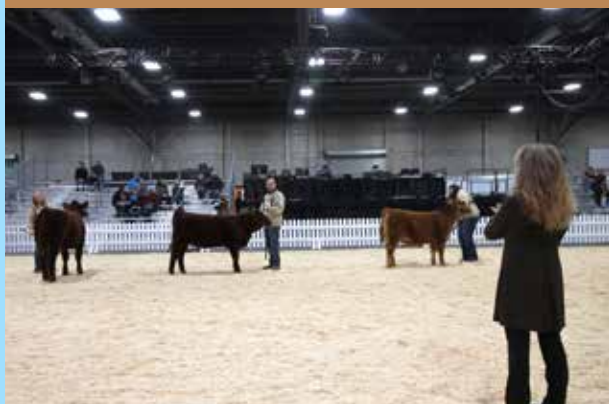
OPTIMIZER LINE - UP