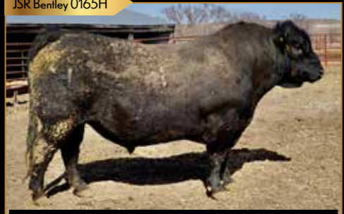
JSR Bentley 0165H