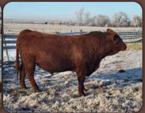
LWH Wally 80H

Thank you to Sky West Salers for the purchase of Ms Lucy 9L! Call for inquiries about these bulls or other genetics at Care Farms!