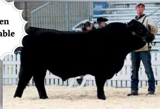
TSC DR J 1J

Feature bulls available by Private Treaty.