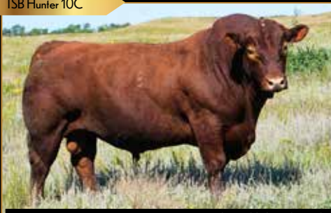
TSB Hunter 10C

Featuring sons of these exceptional herdsires!