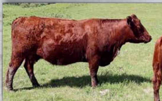
YFS SSS MISS CAVALIER 51H