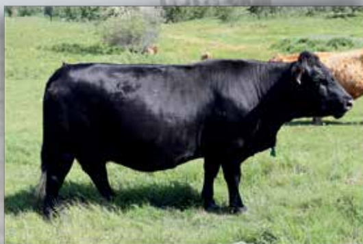
WHR ZELDA 62Z