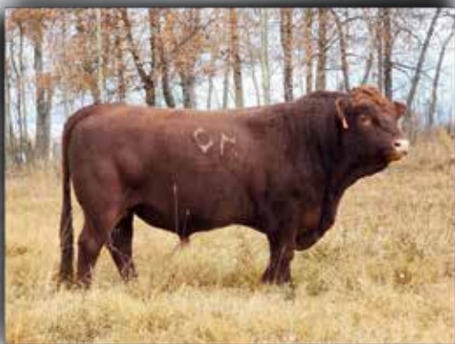
MAC HAWK 99H