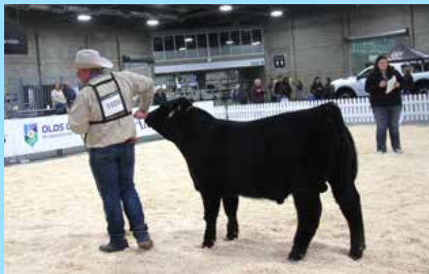
CHAMPION JUNIOR BULL - GIT 27L