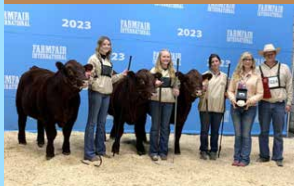
GET OF SIRE - PW STOCK FARM