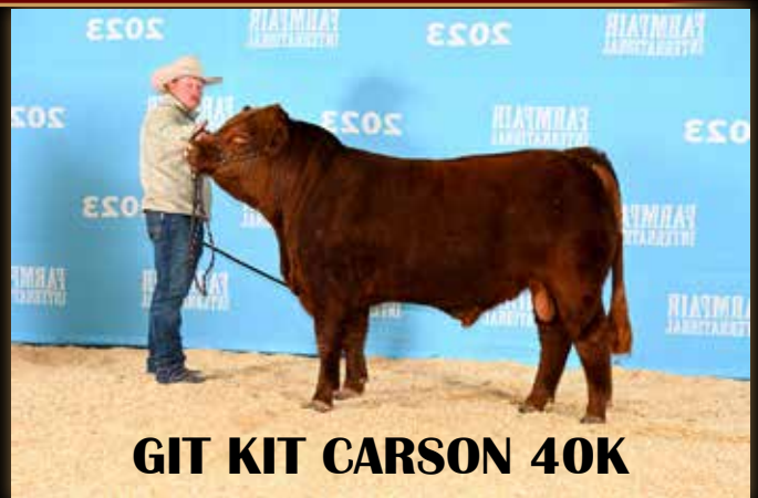
GIT KIT CARSON 40K