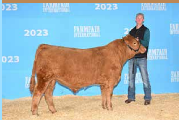
CHAMPION SENIOR BULL - YFS 69L