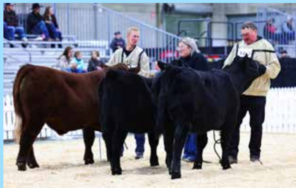
PREMIER BREEDER & EXHIBITOR SCATTERED SPRUCE SALERS