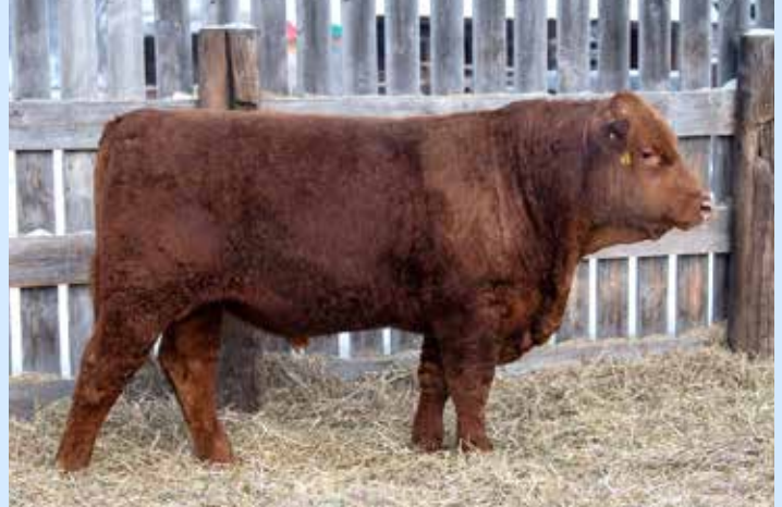
SW 61K by MAC HAWK 99H