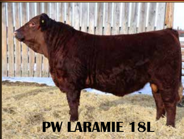
PW LARAMIE 18L