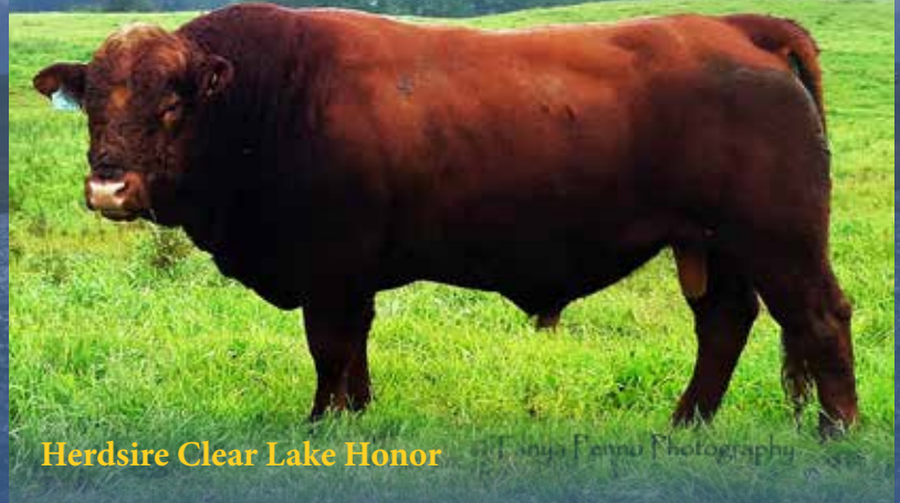
Herdsire Clear Lake Honor