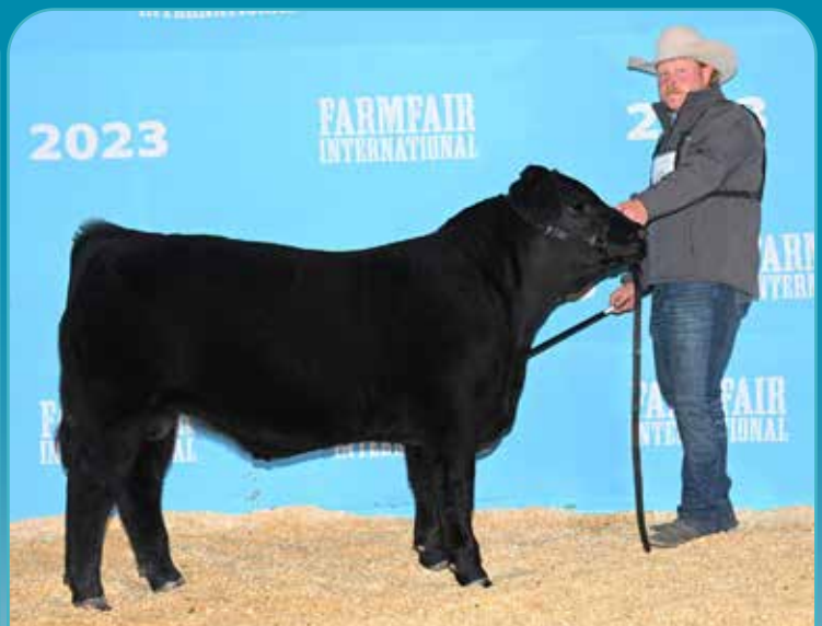
GIT Lawman 27L Reserve Champion Bull Calf