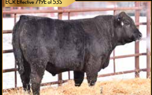
ECR Effective 719E of 53S