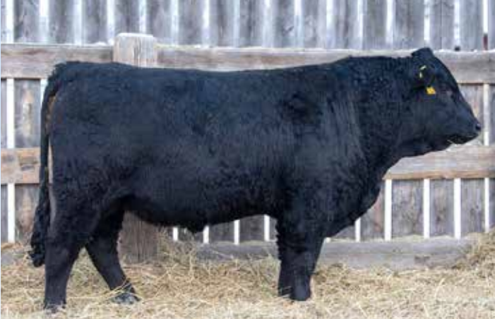
SW 71K by MAC HAWK 99H