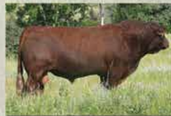
MAC TORRINGTON 139T