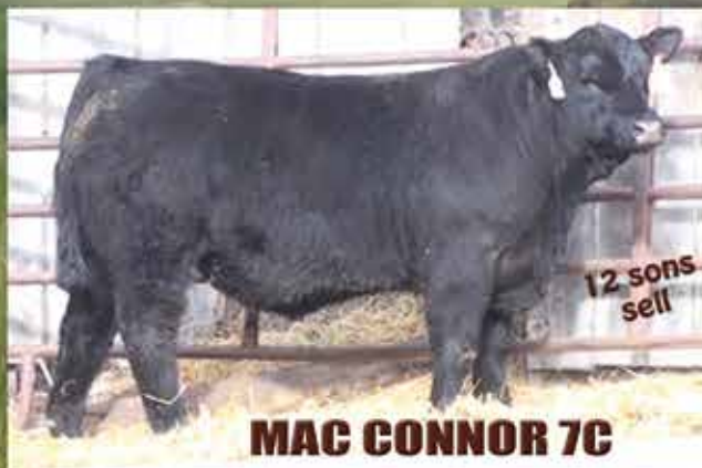
MAC CONNOR 7C

Performance Power 2024 features a large and powerful offering of purebred and high % Salers bulls. Red and Black purebred Salers genetics in quantity, bred for gentle disposition and maternal strength.