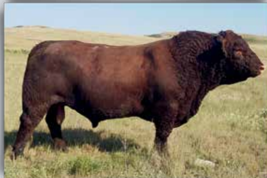
MAC ATOMIC FORCE 36A