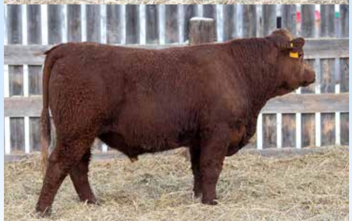
SW 125K by MAC EDITOR 136E

Selling 24 coming two year old Salers bulls. Register to bid at farmgatetimeductions.ca hosted by DLMS.