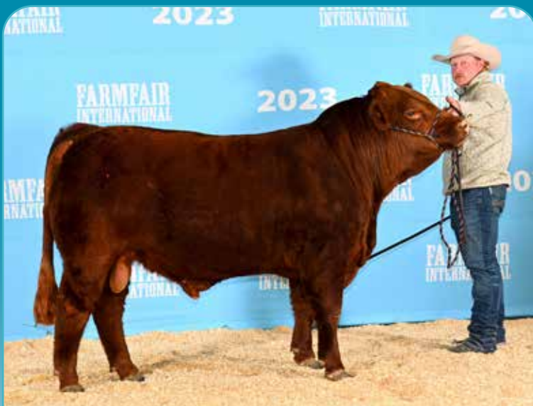
GIT Kit Carson 40K Reserve Champion Yearling Bull