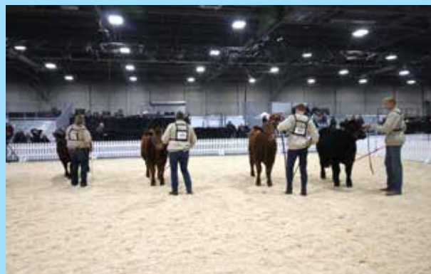
TROPHIES SPONSORED BY FARMFAIR