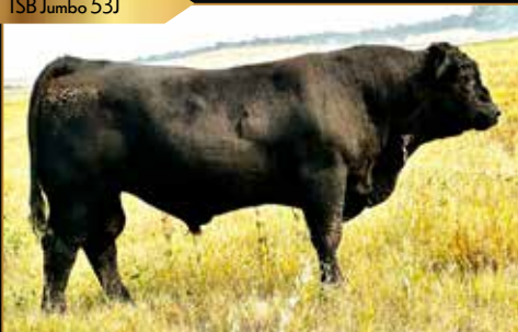
TSB Jumbo 53J