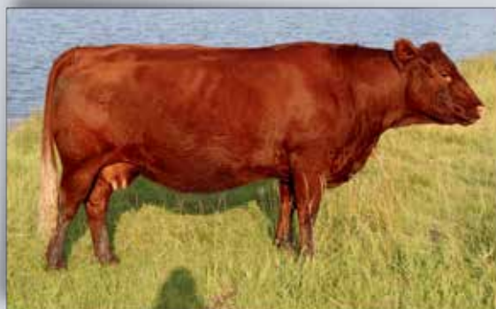
YFS SSS FINESSE 10F