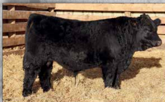
YFS SSS LEGACY 182L