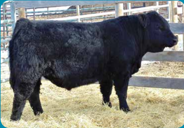
GIT Jefferson 11J

Sons of Senior Herdsire Doocy and high selling bull Grady!