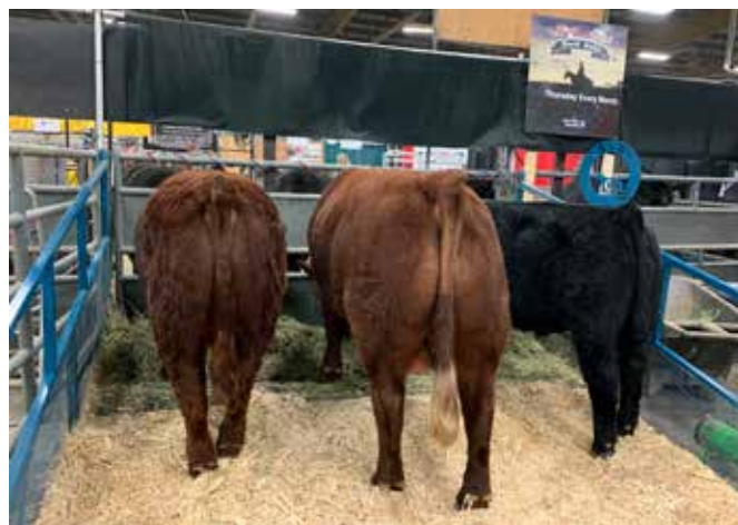
New Trend Salers with Hotshot (center) on display