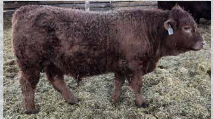
YFS 102J BD: Jan 29 2021 BW: 84 lbs SIRE: PW Cypress 10C