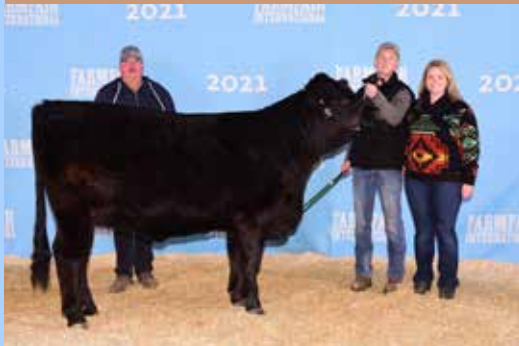
MAC Heiress 132H