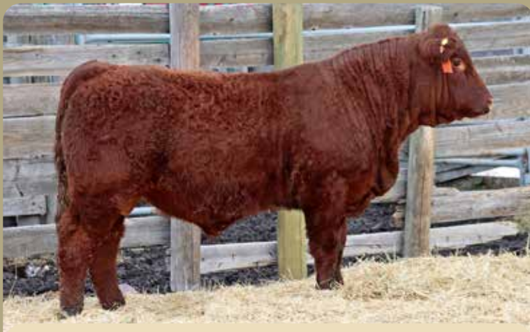
KELA REDLINE 16J $8250 Pictured at 10 months Birth Date: February 6, 2021