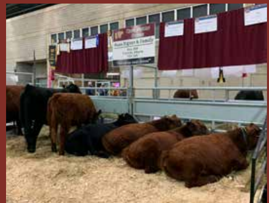
Salers back at Farmfair