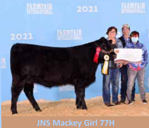
JNS Mackey Girl 77H