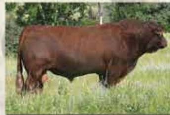
MAC TORRINGTON 139T

We still have semen on these two legendary herdsires from our breeding program available in Canada. Price is $30/unit USD or $24/unit for orders over 30 units.