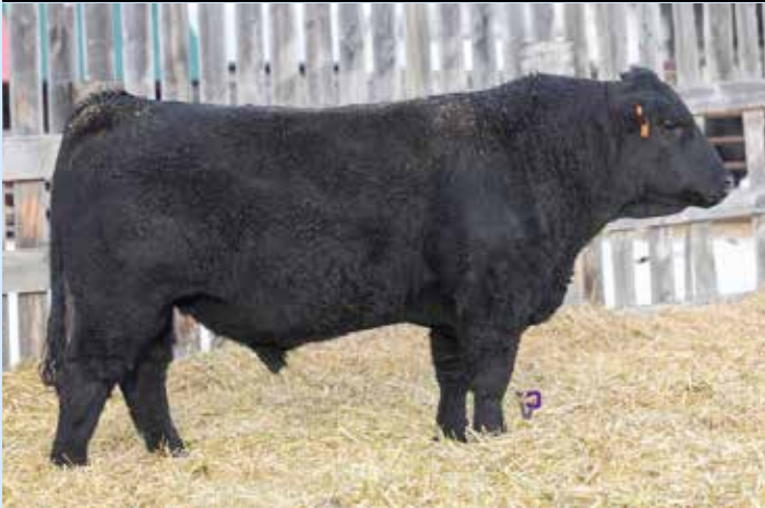
PCSW 12H by MAC Editor 136E