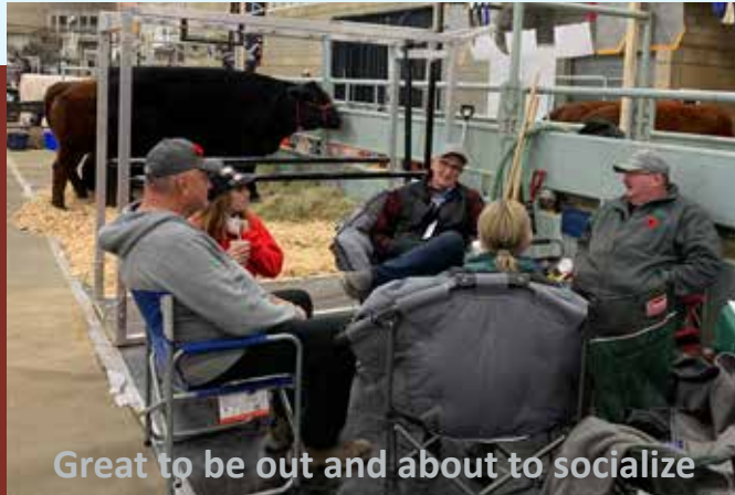
Great to be out and about to socialize