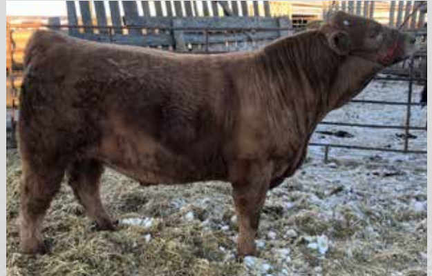
YFS 200J BD: Feb 21 2021 BW: 91 lbs SIRE: WDG David 71D