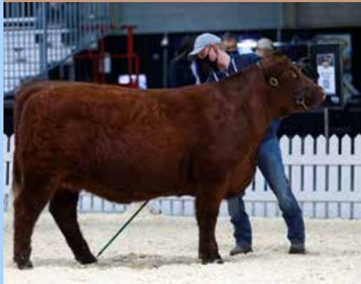
YFS SSS Caesar 56H