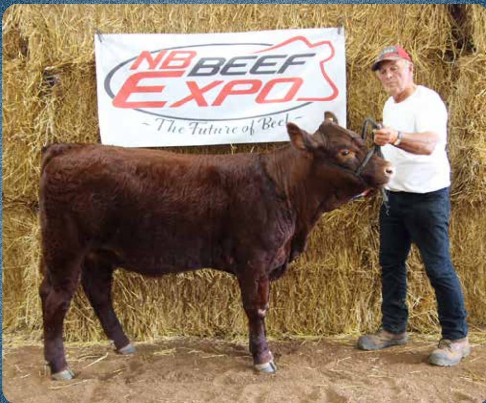
Millstream Drum Jaye 8J