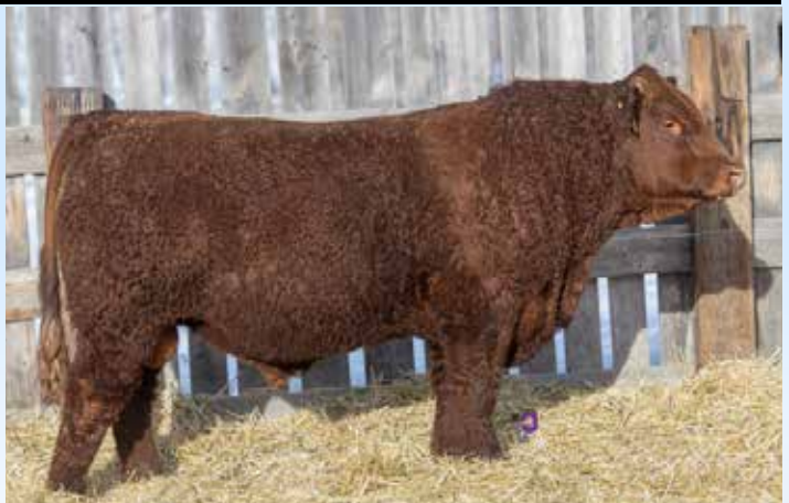
SW 123H by SW Donatello 17D

Selling 25 coming two year old Salers bulls. Register to bid at farmgatetimeductions.ca hosted by DLMS.