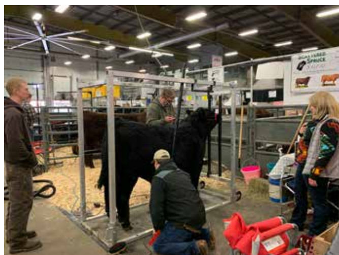
Getting ready to be presented to the judges