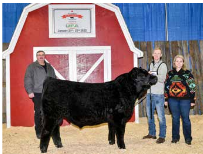
Scattered Spruce Salers with TSC DR 1J