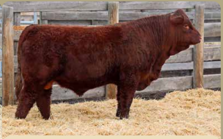
KELA OUTLAW 1J $7500 Pictured at 11 months Birth Date: January 1, 2021

Our select herd of 25 females were selected from 60 females purchased from Wayne Sereda's dispersal. The main focus of our operation is to produce top quality females that are small framed, have good udders, and a quiet disposition. Our bulls will make good heifer bulls or female producers.