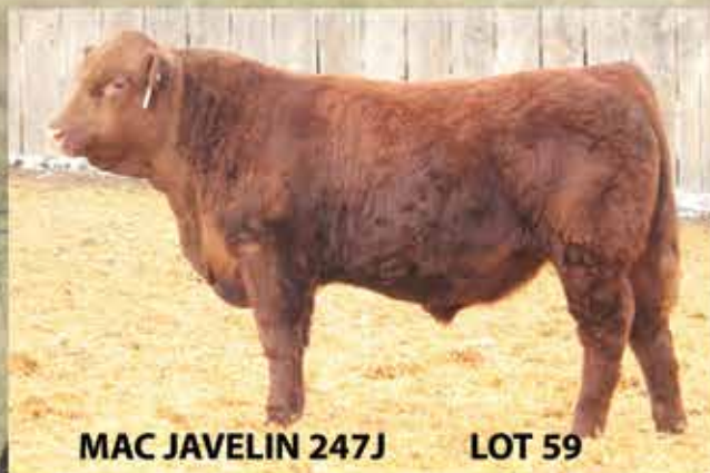
MAC JAVELIN 247J LOT 59