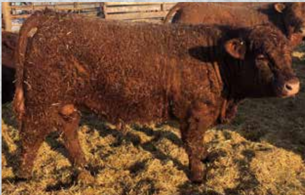
YFS 209J BD: Feb 24 2021 BW: 81 lbs SIRE: GIT Destination 52D