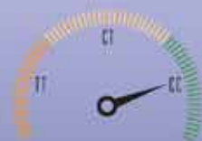
IGF2 LEAN GROWTH