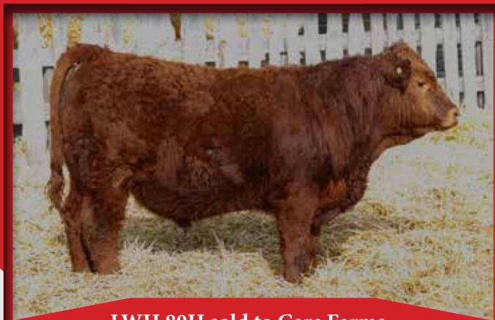
LWH 80H sold to Care Farms