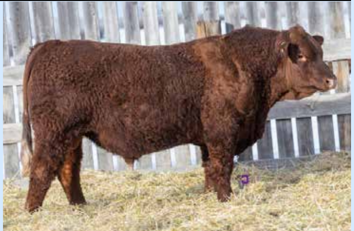
SW 23H by MAC Eaton 450E