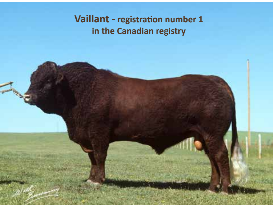
Vaillant - registration number 1 in the Canadian registry

Plans are well underway to celebrate this milestone for the Salers Association of Canada. More details will be announced closer to the event.