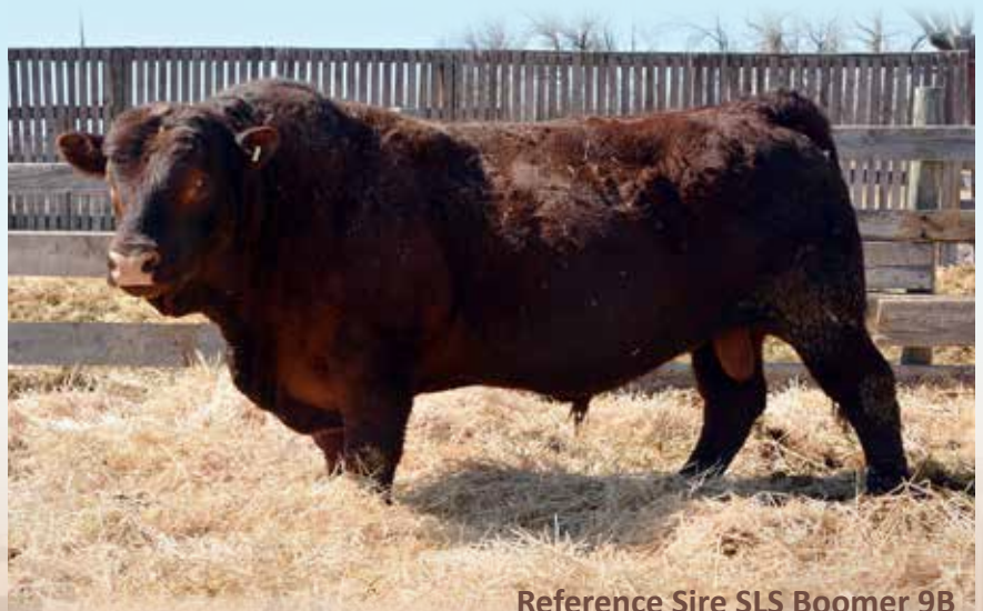
Reference Sire SLS Boomer 9B