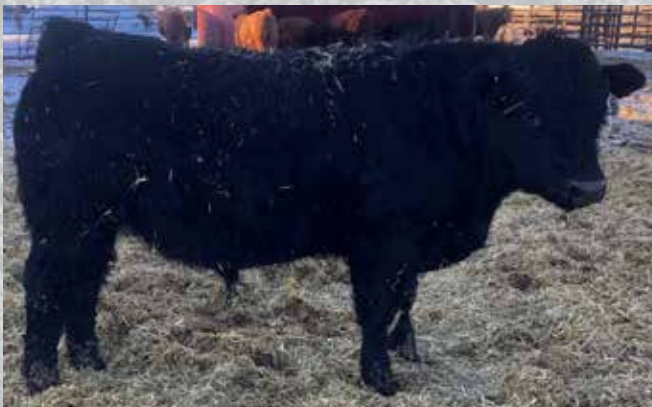
YFS 66J BD: Jan 18 2021 BW: 77 lbs SIRE: MAC Atomic Force 36A