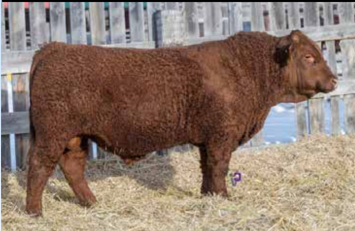
SW 43H by SW Donatello 17D