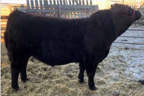
YFS 60J BD: Jan 14 2021 BW: 86 lbs SIRE: YFS SSS Frenzy 25F