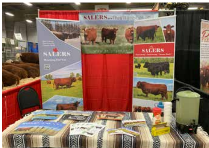
Salers booth with promotional items