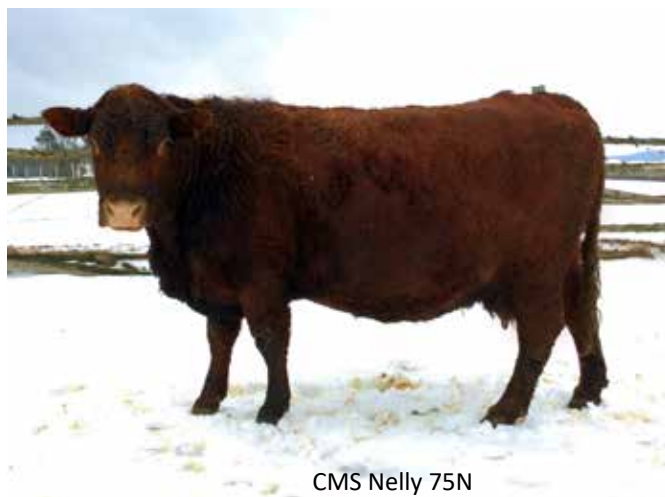
CMS Nelly 75N