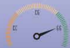
CRH ANIMAL WEIGHT

CRH ↑ HSCW by up tp 10lbs, whilst ↑ REA. Combined with IGF2 these traits greatly ↑ the carcass quality of an animal