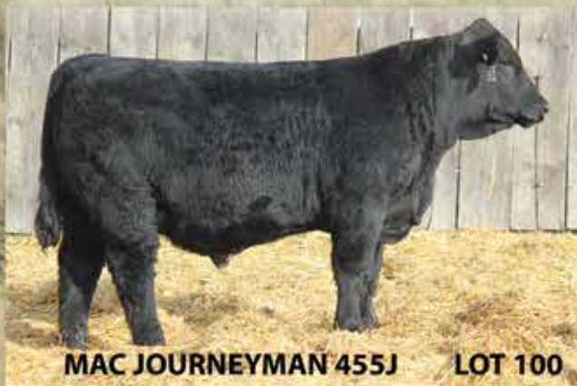
MAC JOURNEYMAN 455J LOT 100

Performance Power 2022 features our largest offering of purebred and high % Salers bulls ever. This black purebred son of ECR CASEY and red purebred son of ECR FIRST STEP are just a sampling.