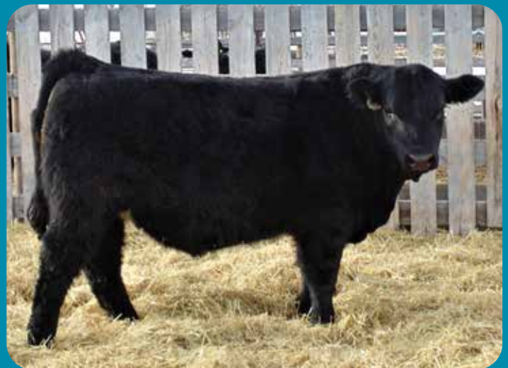
GIT Juniper 29J

Come and visit us on March 26th at the farm to check out these OR other bulls offered in the New Trend Sales Bull Sale. Everybody welcome!