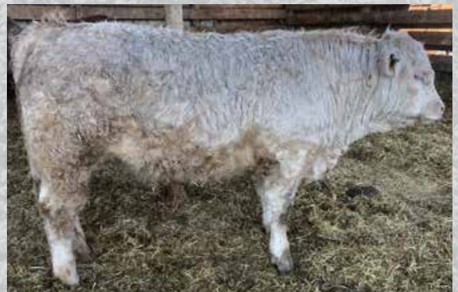
YFS 113J BD: Feb 2 2021 BW: 73 lbs SIRE: YFS Denali 67D

Your source for Red, Black, Tan & White Purebred Salers. Cattle selected for easy calving, easy fleshing, moderate frame, maternal strength, longevity and disposition.